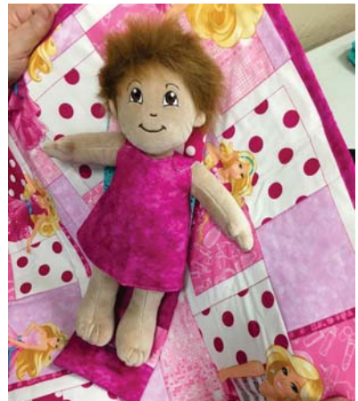
All pictures are courtesy of Georgia Goode.